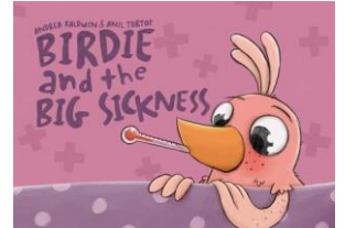
Birdie & the Big Sickness