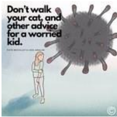
Don't Walk Your Cat & Other Advice for a Worried Kid

Free children friendly ebooks available to download (Click on book title or book cover)