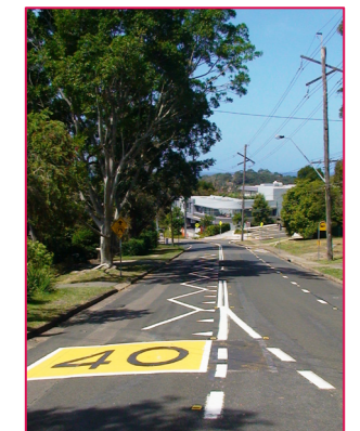
Photos showing dividing lines and examples of No Stopping areas on Anana Road and Elanora Road..

Fines apply for parking longer than indicated.